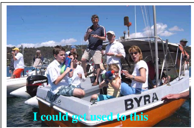
I could get used to this

All of this under the watchful eye of our parents