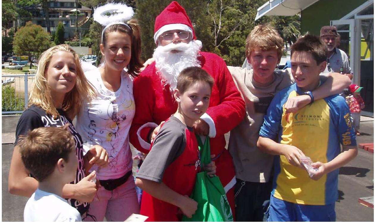
Yet another Junior Committee meeting with our special guest.