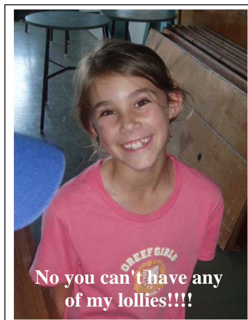
No you can't have any of my lollies!!!!

This BYRA thing that we have going is very special. It's not about winning races or spending lots of money, it's about kids having lots of fun as a group and with the parents ( at a safe distance ). It's great to see how you all grow in confidence and meet lots of new friends.