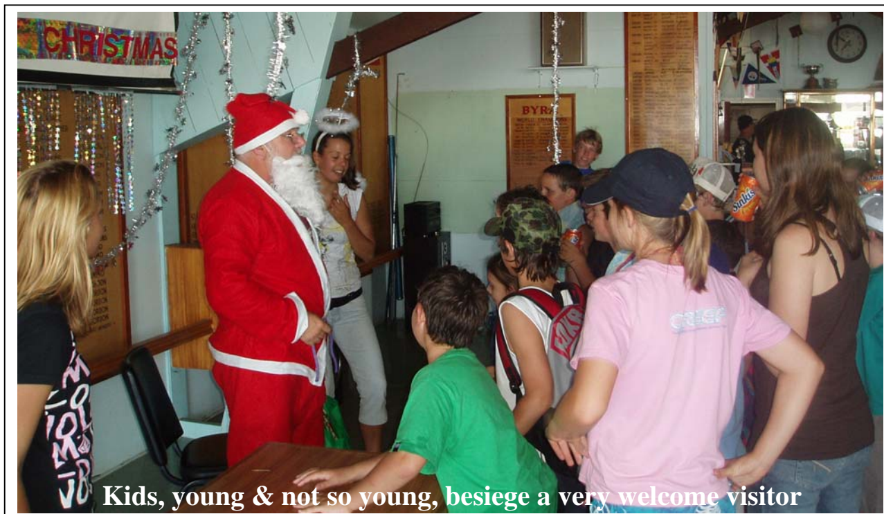
Kids, young & not so young, besiege a very welcome visitor

Santa was first seen coming across the bay and through the moorings in the company of some very shady looking characters, all yelling HO HO HO. What strange behaviour, given a small group of our little darlings wanted to confront him on the deck with the usual welcome... "throw him in" they were heard to yell.