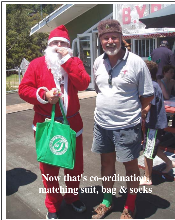
Now that's co-ordination, matching suit, bag & socks